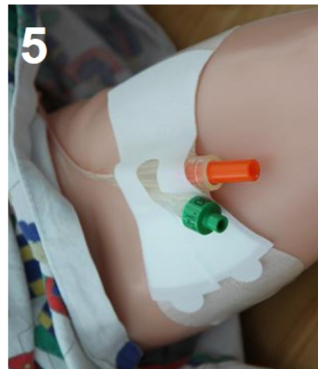
5 Pull the paper backing from one side of the Grip-Lok ® . Then pull the paper backing from the other, to secure the Grip-Lok ® in the desired position on the skin.