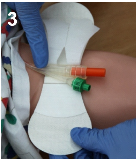
3 Place the bifurcation crotch centrally on the Grip-Lok ® .