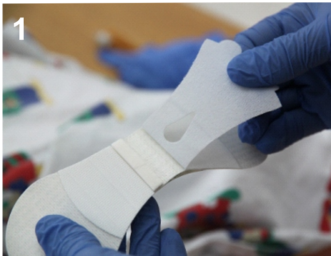
1 Open the Velcro ® lid.

Prepare the skin according to the standard hospital protocol for dressing application. Skin prep or hair removal may be required on some patients for better adhesion.